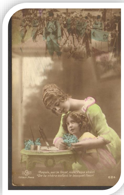
Carte postale écrite par la fille d'Henri Rouède (12 août 1915)